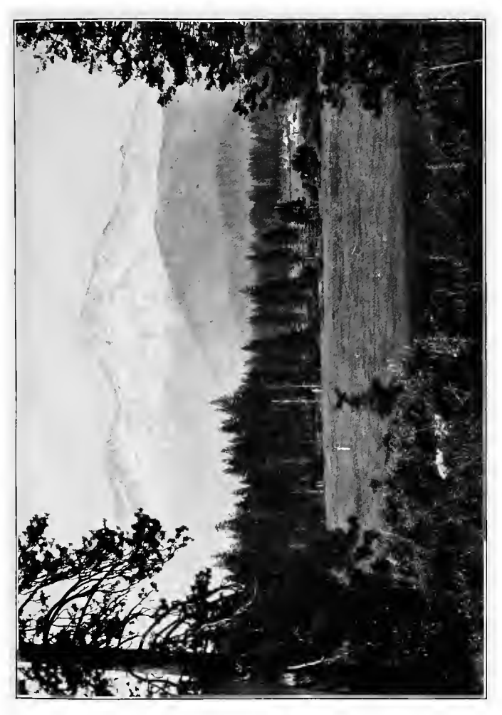
THE WHITE EARTH-SPIRIT, SHASTA!